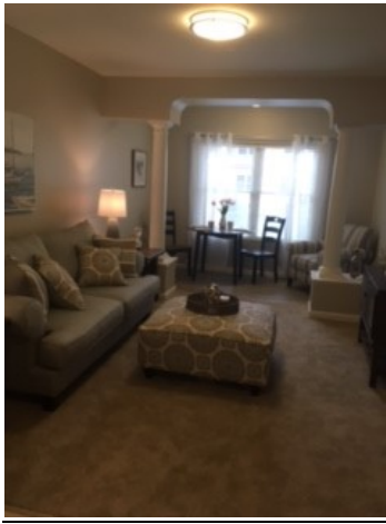
Beautiful living room