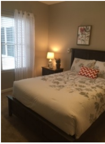
Bright comfy bedroom