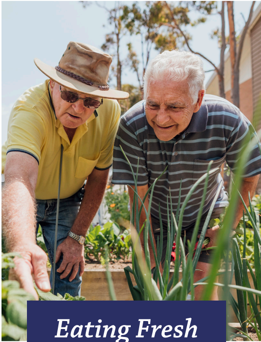
Eating Fresh and Local