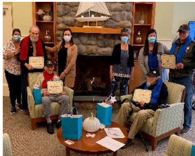
The Residence at Great Woods had an eventful Veterans Day. Old Colony Hospice hosted a Veteran's Cafe; they handed out certificate, pins, and personalized blankets. They then headed out to the center of town to watch the Veteran's Day parade and celebrated that afternoon with treats and cocktails !