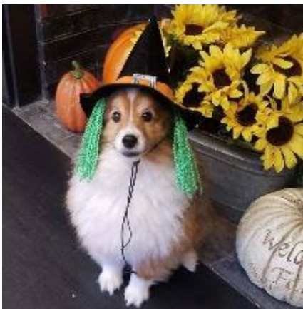
First Place Libby the Witch

At The Residence at Cedar Dell , in addition to celebrations for their residents and staff, they hosted a Pet Halloween Costume Contest this year. Voting took place in person for their residents, staff, and visitors and on Facebook throughout Halloween weekend. Here are the winners: