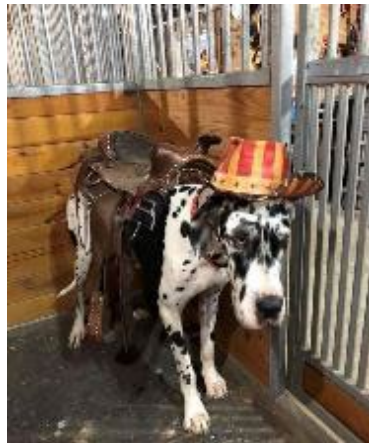
Second Place Minnie the Cowgirl