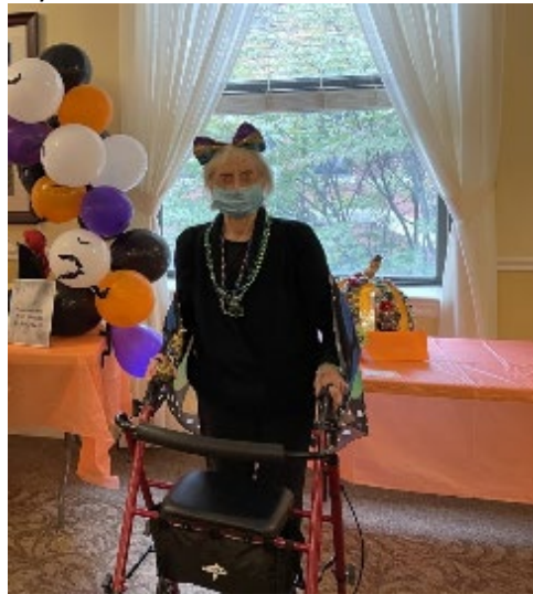
Bridges by EPOCH at Mashpee residents celebrated Halloween by painting pumpkins and attending a mask party. They also honored their residents who served our country.