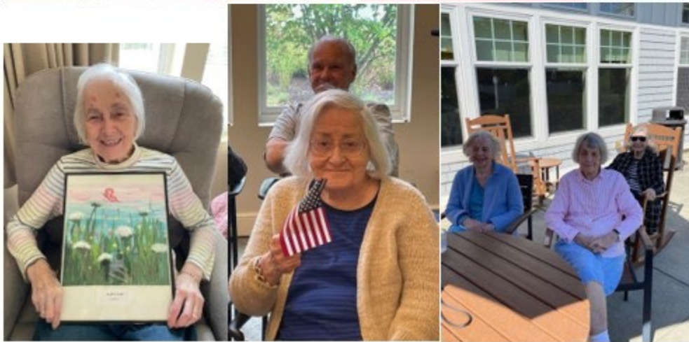
The Residence at Penniman Hill in Hingham shared how residents expressed their creativity by crafting beautiful flower arrangements to be enjoyed by everyone in the community.